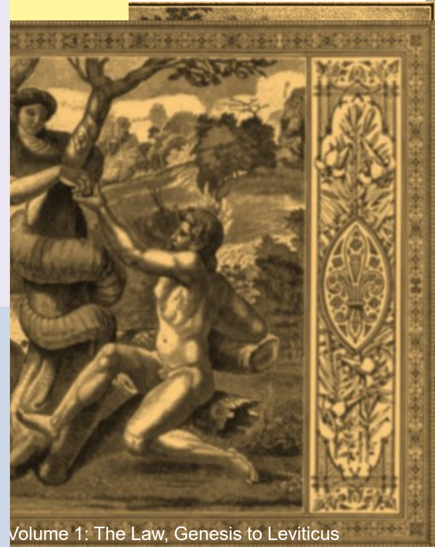
Volume 1: The Law, Genesis to Leviticus