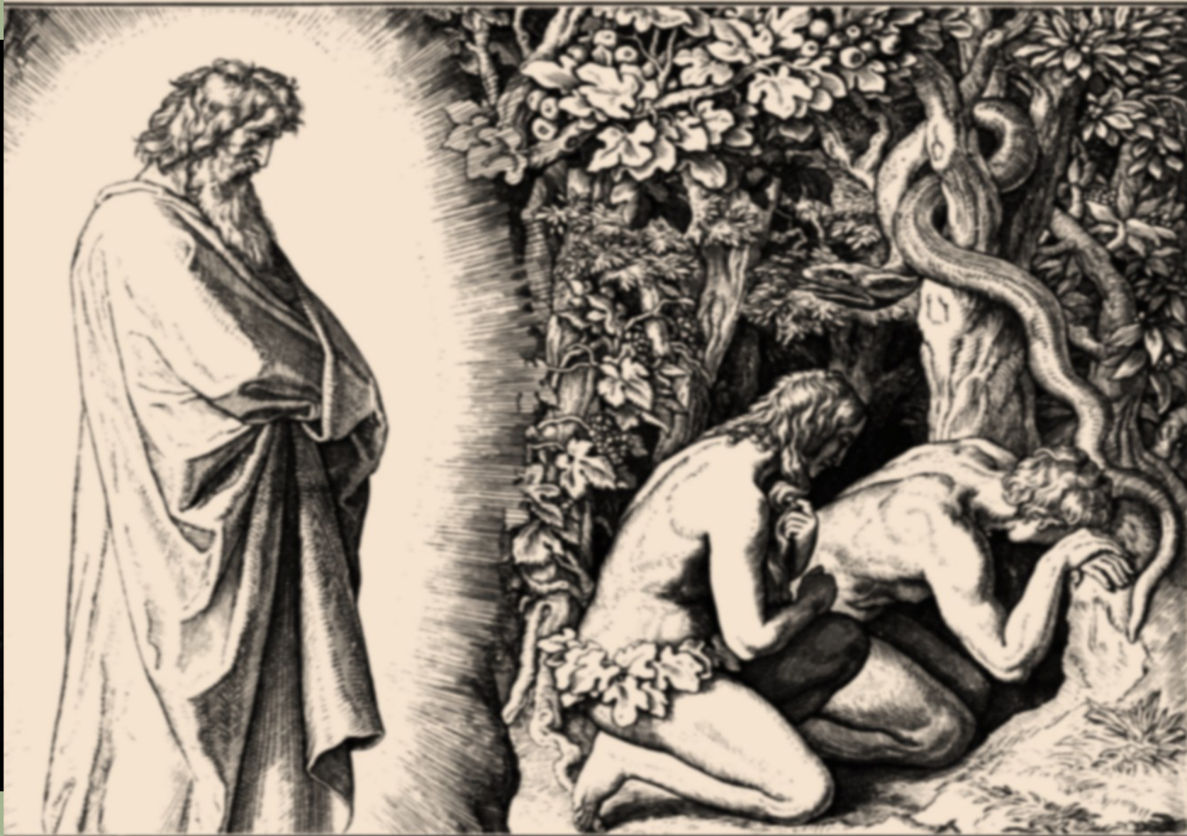
The Bible and its Story, Volume 1: The Law, Genesis to Leviticus