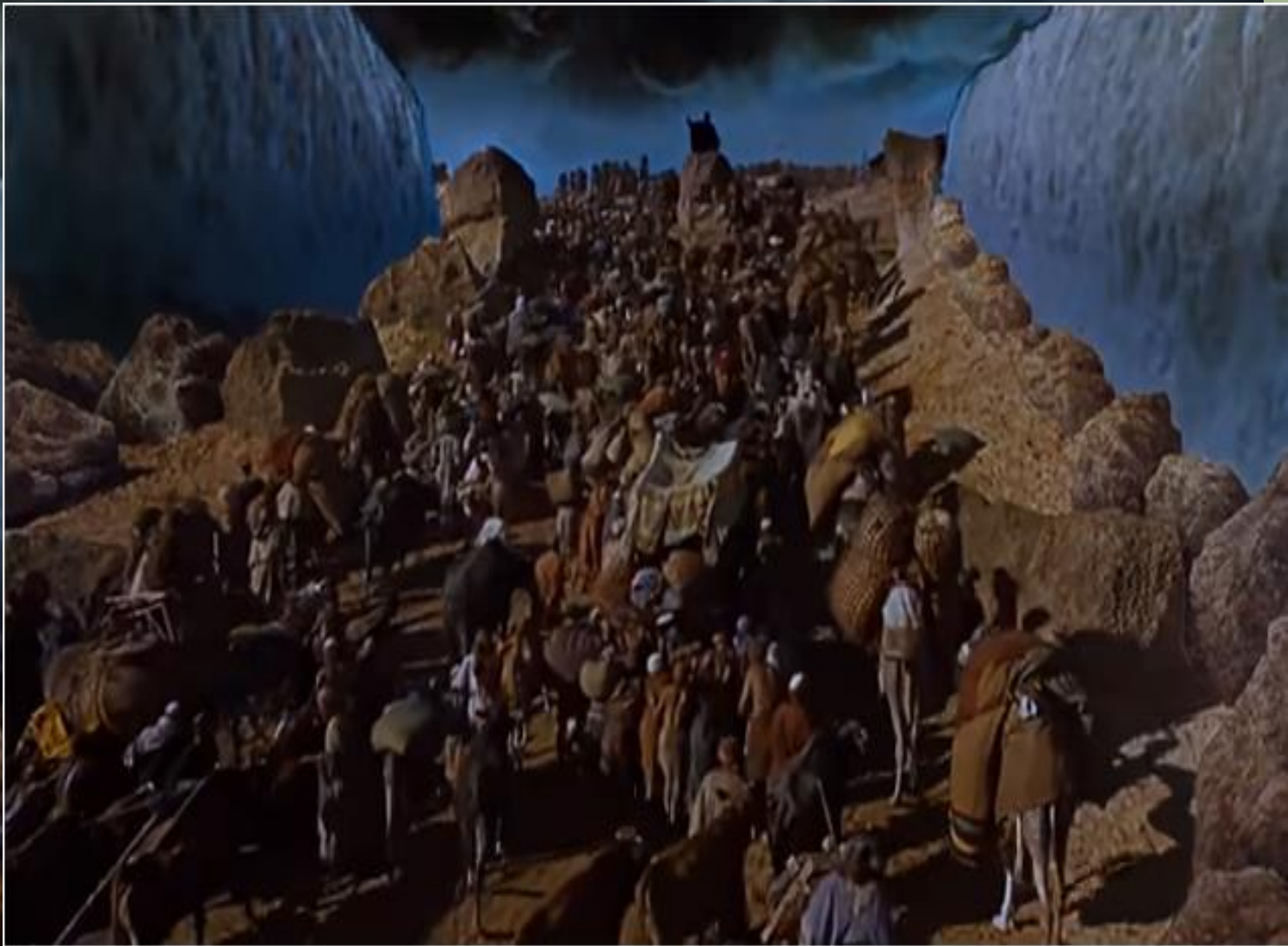
The Parting Of The Red Sea - The Ten Commandments 1956